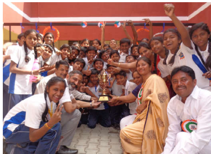
In the process of making the RPS students winners for Life