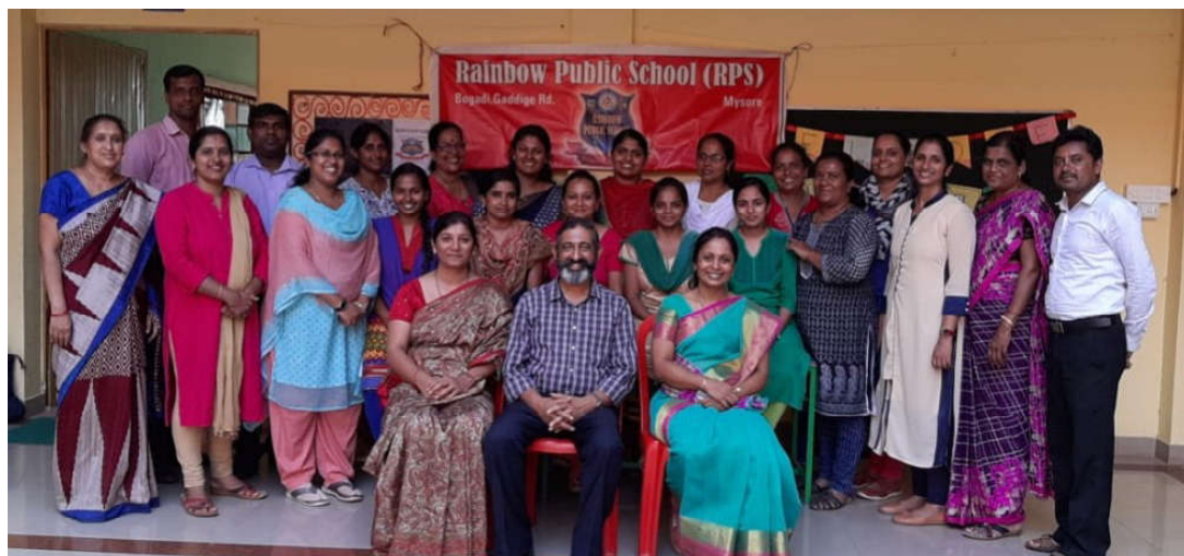
The Rainbow Family in all smiles ready for the New Beginning.

Best greetings and a warm welcome to one and all.